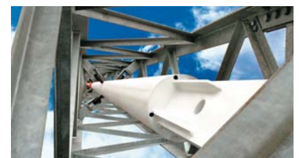
Wind Measuring Masts